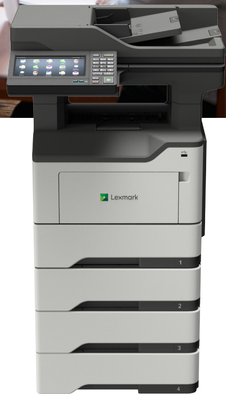
MX622adhe with optional trays