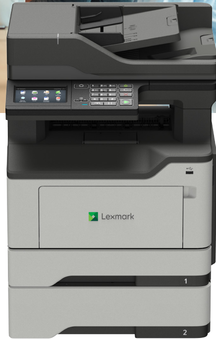
MB2442adwe with optional tray