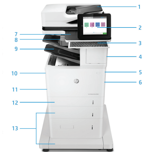
HP LaserJet Enterprise Flow MFP M632z shown