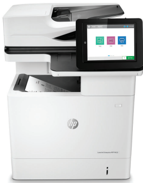
HP LaserJet Enterprise MFP M632h

This HP LaserJet MFP with JetIntelligence combines exceptional performance and energy efficiency with professional-quality documents right when you need them—all while protecting your network from attacks with the industry's deepest security. 1