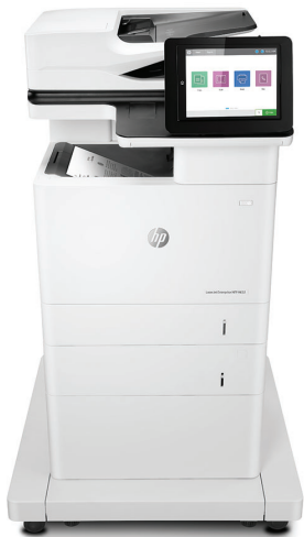
HP LaserJet Enterprise MFP M632ft