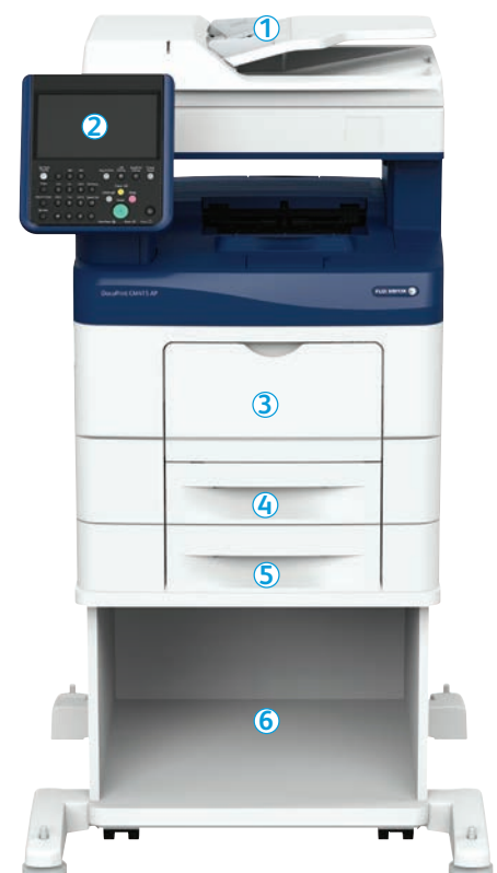
DocuPrint CM415 AP full configuration