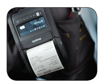
Over the shoulder straps and belt clips available for ease of movement while printing in the field.