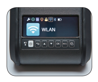
USB, Bluetooth, WiFi and AirPrint to handle applications on site or outdoors.