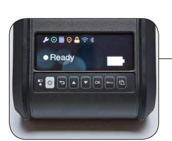
Easy use and navigate through an intuitive colour screen (RJ-3150 only)

The compact, ergonomic and lightweight design of the RJ series allows the printer to fit in places where space is limited, and accessories are available for in-vehicle mounting or carrying in the field.