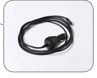
Add the optional power charging car kits