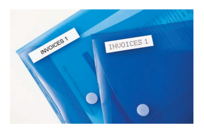
Identify all your important paperwork with clear labelling of file folders