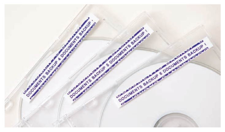
Locate the correct CD or DVD in an instant through clear labelling of disc contents